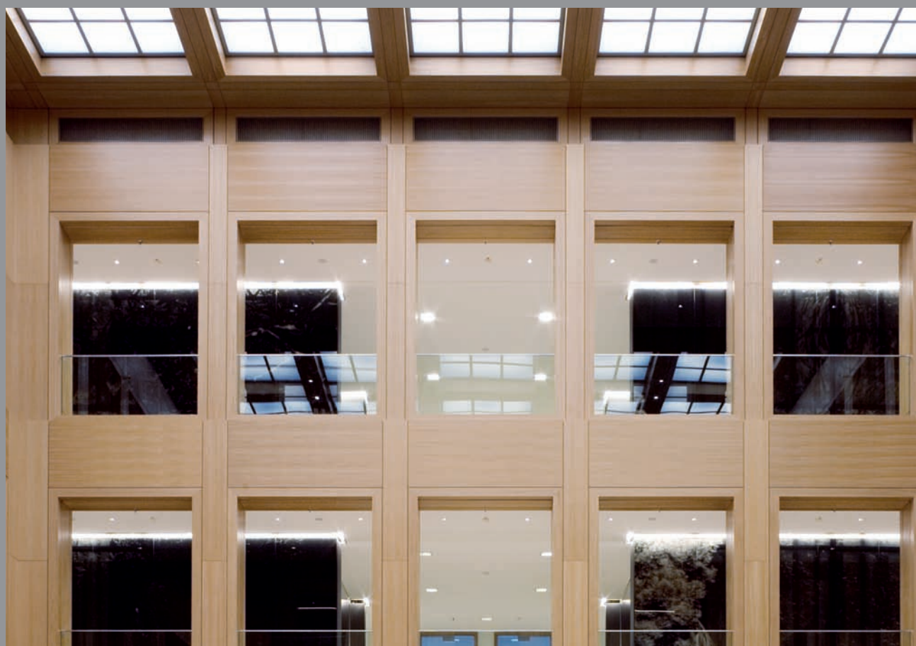
Lighting Design: Mailänder Licht Design